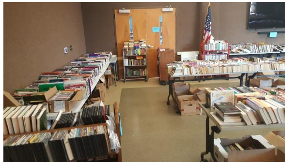
(Friends semi-annual book sale)

The Friends of the Logan County Public Library graciously accepts donations.