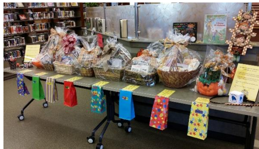
(Open house give-away)