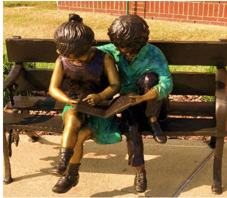
(Children on Bench Reading Statue)

The Friends of the Logan County Public Library is a 501c3 organization established in 1968.